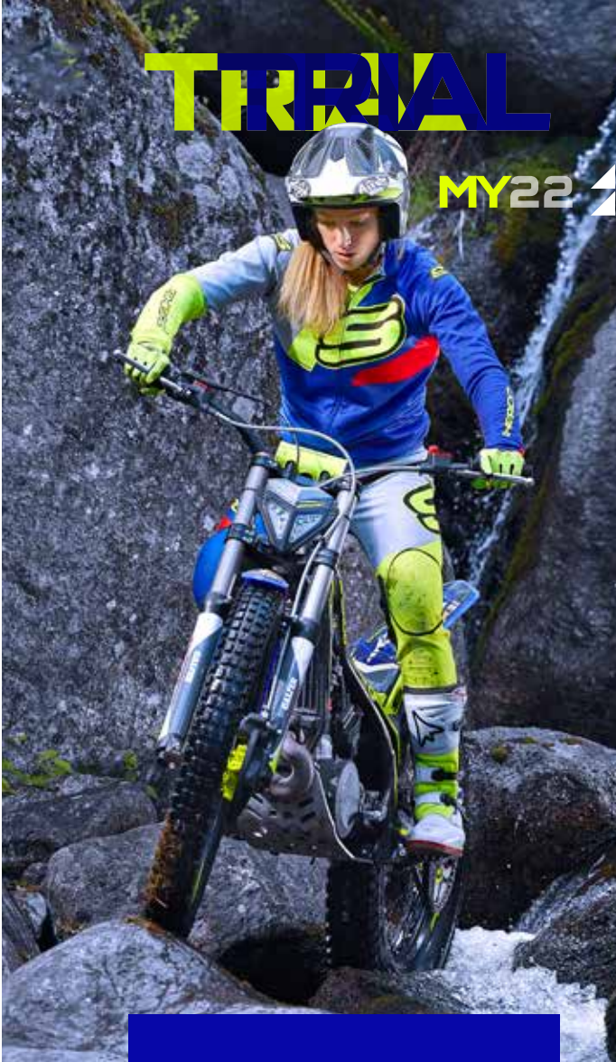
TRIAL MY22 SHERCO