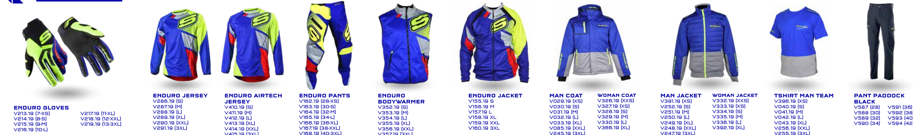
ENDURO GLOVES V213.19 (7XS) V214.19 (8S) V215.19 (9M) V216.19 (10L) V217.19 (11XL) V218.19 (12XXL) V219.19 (13-3XL)