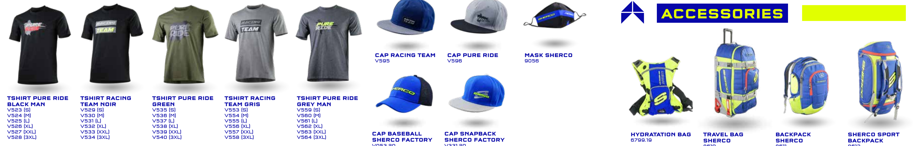
TSHIRT PURE RIDE BLACK MAN V523 (S) V524 (M) V525 (L) V526 (XL) V527 (XXL) V528 (3XL) TSHIRT RACING TEAM NOIR V529 (S) V530 (M) V531 (L) V532 (XL) V533 (XXL) V534 (3XL) TSHIRT PURE RIDE GREEN V535 (S) V536 (M) V537 (L) V538 (XL) V539 (XXL) V540 (3XL) TSHIRT RACING TEAM GRIS V541 (S) V542 (M) V543 (L) V544 (XL) V545 (XXL) V546 (3XL) TSHIRT PURE RIDE GREY MAN V547 (S) V548 (M) V549 (L) V550 (XL) V551 (XXL) V552 (3XL) CAP RACING TEAM V595 CAP PURE RIDE V596 MASK SHERCO 6056 CAP BASEBALL SHERCO FACTORY V053.20 CAP SNAPBACK SHERCO FACTORY V331.20