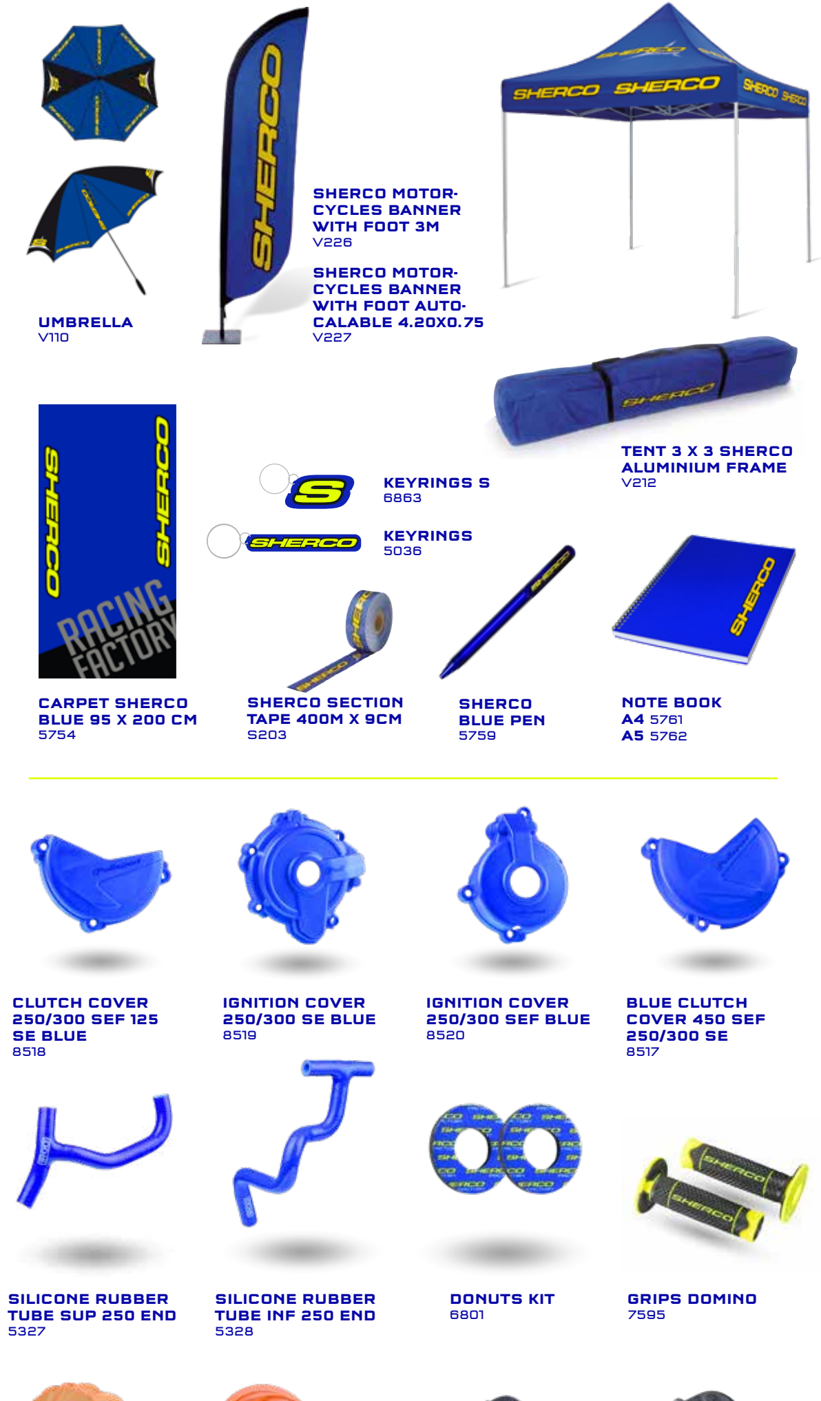
UMBRELLA V110 CARPET SHERCO BLUE 95 X 200 CM 5754 SHERCO SECTION TAPE 400M X 9CM 5603 SHERCO BLUE PEN 5759 NOTE BOOK A4 5761 A5 5762 KEYRINGS S 6663 KEYRINGS 5036 TENT 3 X 3 SHERCO ALUMINIUM FRAME V216 SHERCO MOTORCYCLES BANNER WITH FOOT 3M V228 SHERCO MOTORCYCLES BANNER WITH FOOT AUTOCALABLE 4.20X0.75 V227