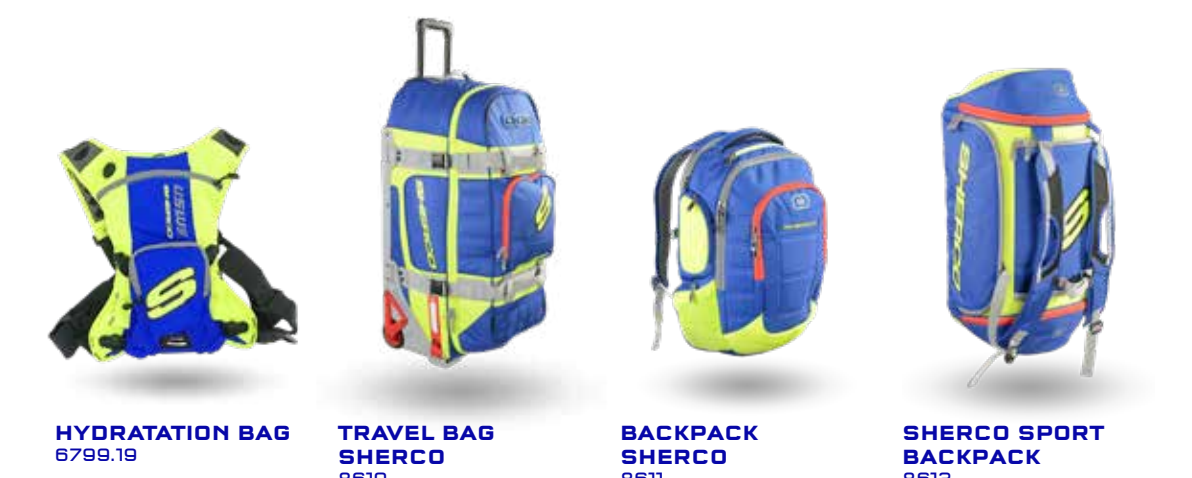
HYDRATION BAG 6799.19 TRAVEL BAG SHERCO 6610 BACKPACK SHERCO 6611 SHERCO SPORT BACKPACK 6612