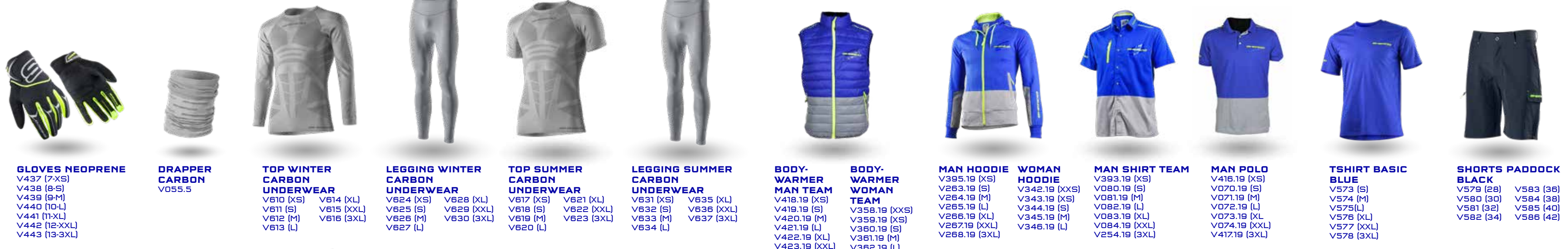
GLOVES NEOPRENE V437 (7XS) V438 (8S) V439 (9M) V440 (10L) V441 (11XL) V442 (12XXL) V443 (13-3XL) DRAPPER CARBON V055.5 TOP WINTER CARBON UNDERWEAR V610 (XS) V611 (S) V612 (M) V613 (L) V614 (XL) V615 (XXL) V616 (3XL) V617 (L) V618 (XL) V619 (XXL) V620 (3XL) LEGGING WINTER CARBON UNDERWEAR V624 (XS) V625 (S) V626 (M) V627 (L) V628 (XL) V629 (XXL) V630 (3XL) TOP SUMMER CARBON UNDERWEAR V617 (XS) V618 (S) V619 (M) V620 (L) V621 (XL) V622 (XXL) V623 (3XL) LEGGING SUMMER CARBON UNDERWEAR V631 (XS) V632 (S) V633 (M) V634 (L) V635 (XL) V636 (XXL) V637 (3XL) BODY-WARMER MAN TEAM V418.19 (XS) V419.19 (S) V420.19 (M) V421.19 (L) V422.19 (XL) V423.19 (XXL) V424.19 (3XL) BODY-WARMER WOMAN TEAM V359.19 (XS) V360.19 (S) V361.19 (M) V362.19 (L) V363.19 (XL) MAN HOODIE V395.19 (XS) V396.19 (S) V397.19 (M) V398.19 (L) V399.19 (XL) WOMAN HOODIE V342.19 (XS) V343.19 (S) V344.19 (M) V345.19 (L) V346.19 (XL) MAN SHIRT TEAM V080.19 (XS) V081.19 (S) V082.19 (M) V083.19 (L) V084.19 (XL) MAN POLO V418.19 (XS) V419.19 (S) V420.19 (M) V421.19 (L) V422.19 (XL) TSHIRT BASIC BLUE V573 (S) V574 (M) V575 (L) V576 (XL) V577 (XXL) V578 (3XL) SHORTS PADDOCK BLACK V579 (8S) V580 (9M) V581 (9M) V582 (9M) V583 (9M) V584 (9M) V585 (9M) V586 (9M) V587 (9M) V588 (9M) V589 (9M) V590 (9M) V591 (9M) V592 (9M) V593 (9M) V594 (9M) V595 (9M) V596 (9M) V597 (9M) V598 (9M) V599 (9M) V600 (9M)